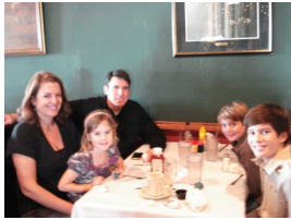
The NDSEVA Communion Mass and Breakfast is held the first Sunday in December.