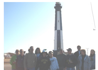
NDSEVA members at the Water Station for Shamrock 2009